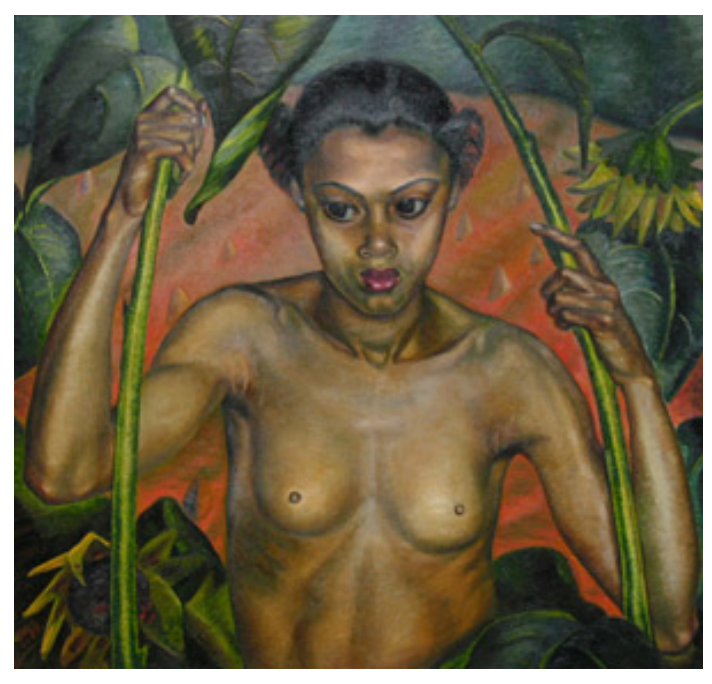
FIG. 5 Prudence Heward. Negress with Sunflowers. Oil in canvas. <www.klinkhoff.com/gwk/home/gwkexhbrowse.asp?WID=1333&artist=60>)