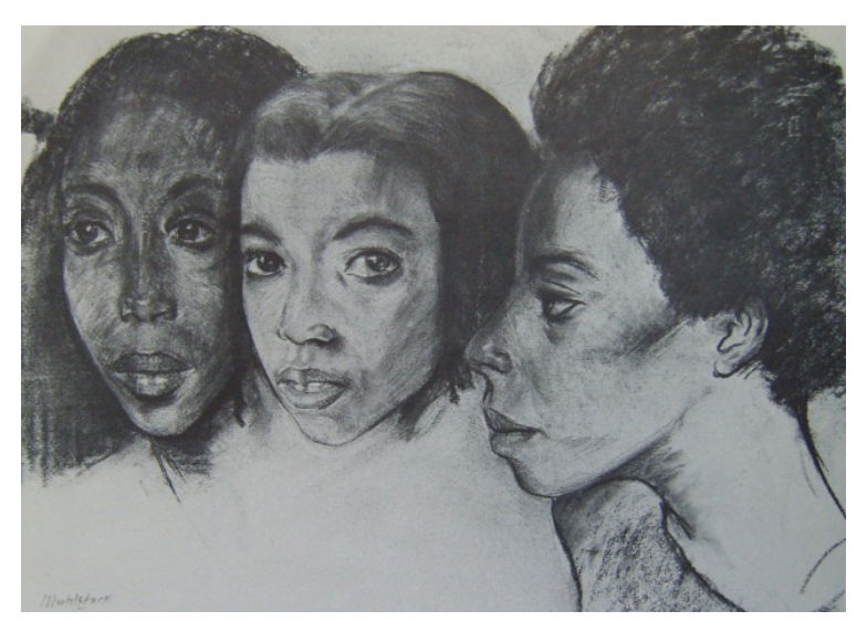
FIG. 3 Louis Muhlstock. Negro Children. Charcoal on paper. (Image: Kenneth Saltmarche)