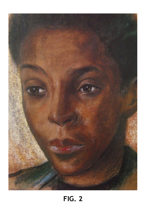
Louis Muhlstock. Young Negro Boy. Ca. 1939. Charcoal and pastel on paper. 38.1 x 33 centimeters. Private collection. (Image: Monique Nadeau-Somier)