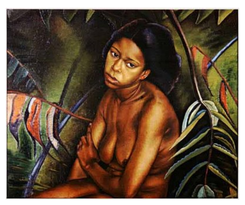
FIG. 4 Prudence Heward, Dark Girl . 1935. Oil on canvas. 92 x 102 centimeters. (Image: Charmaine Nelson)